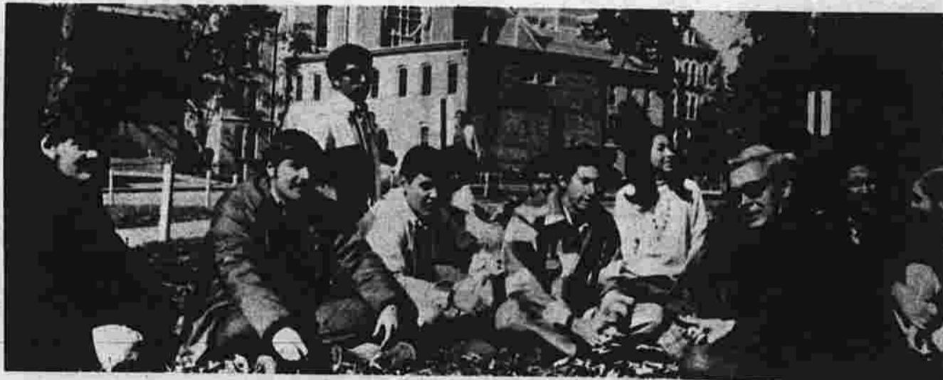
New image of Notre Dame University is reflected in informal campus interview filmed by NBC