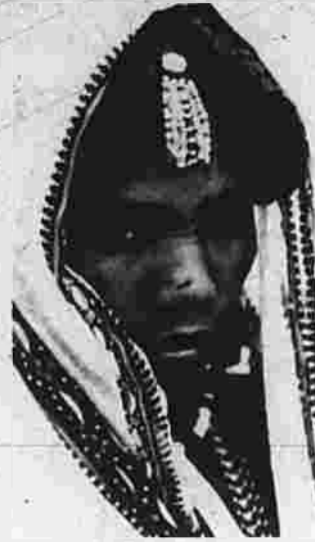
Danakil girl is painful beauty in CBS special on Ethiopia, Dec. 2.

Stockwell, Leslie Nielsen, Doug McClure, Tony Soprano, (18) What's My Line? (C) (19) Merv Griffin Show (C) (20) News—Prayer and Sign Off (C) (21) News and Weather—Moment of Meditation and Sign Off (C)