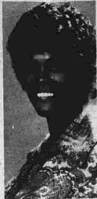
Dionne Warwick sings in "Festival at Forda," to be aired Thursday.

Guest: Mickey Rooney. (44) Young Lawyers (C) (45) I Spy (C) (46) I Takes a Thief (C) (47) News and Sign Off (C) (48) News and Sign Off (C) (49) News and Sign Off (C) (50) News and Sign Off (C) (51) News and Sign Off (C) (52) News and Sign Off (C) (53) News and Sign Off (C) (54) News and Sign Off (C) (55) News and Sign Off (C) (56) News and Sign Off (C) (57) News and Sign Off (C) (58) News and Sign Off (C) (59) News and Sign Off (C) (60) News and Sign Off (C) (61) News and Sign Off (C) (62) News and Sign Off (C) (63) News and Sign Off (C) (64) News and Sign Off (C) (65) News and Sign Off (C) (66) News and Sign Off (C) (67) News and Sign Off (C) (68) News and Sign Off (C) (69) News and Sign Off (C) (70) News and Sign Off (C)