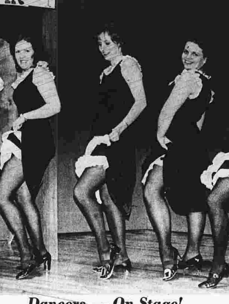
The Flora Dora Girls pose outside of Clancy's Bar at a dress rehearsal last night for the "Gay Nineties Review." The show will be held tonight at 7:30 p.m. in the old town hall, Rt. 6, Andover for the benefit of the Hebron Recreation Commission.